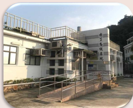
North Lamma GOPC