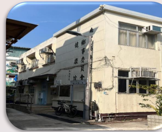
Sok Kwu Wan GOPC