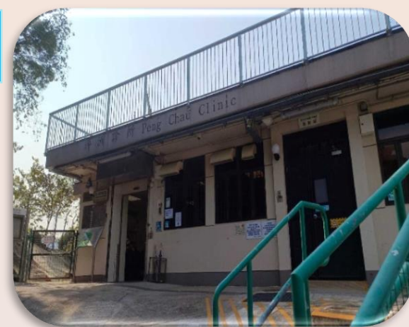
Peng Chau GOPC